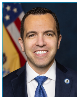
Message from NJ Attorney General MATTHEW J. PLATKIN

In 2025, VIVA will continue to build upon the foundation it has been building since its creation in September 2022.